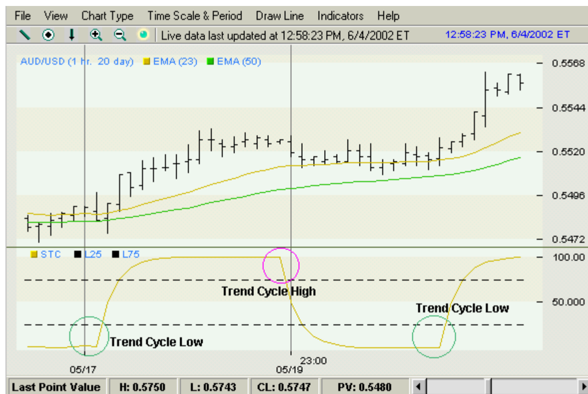
Chart 4– AUD/USD 1 Hour Chart

In the chart Chart 3, Aussie prices were sharply rising. The ideal time to buy into this uptrend is after a trend cycle bottoms out, after a pause or retracement in the uptrend had ends. That can be hard to determine or see, though, using EMA lines alone (see Chart 3). But look what happens when we add the Schaff Trend Cycle indicator (see Chart 4).