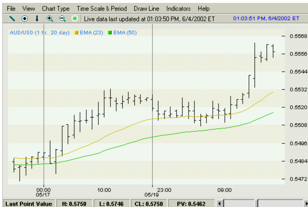
Chart 3 – AUD/USD 1 Hour Chart

This chart shows 23-period and 50-period EMA lines (yellow and green, respectively).