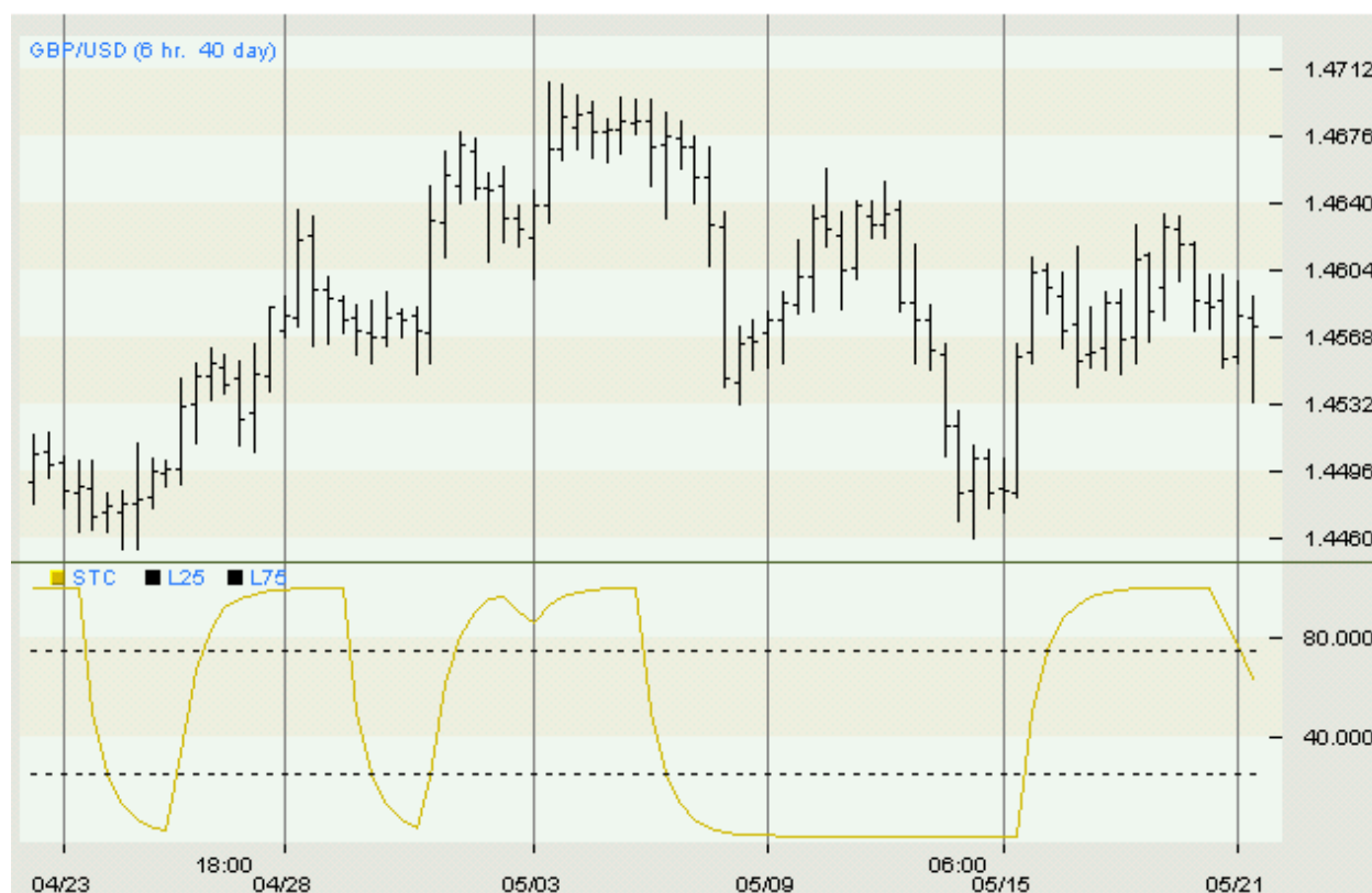
Chart 1 – GBP/USD Six Hour Chart

The Schaff Trend Cycle Indicator identifies trend cycle highs and lows.